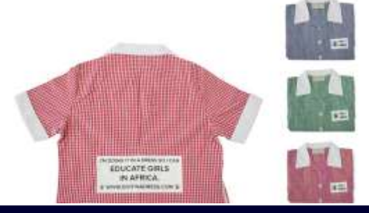
On Friday 23 October, MVHS is doing it in a dress to raise money for girls' education.

out on education due to limited resources and different cultural values. At last count, of the 775 million adults around the world who cannot read or write, two-thirds of them (493 million) are women. Many girls are forced into marriage at early ages—as young as 11, stripping them of what access to education they had.