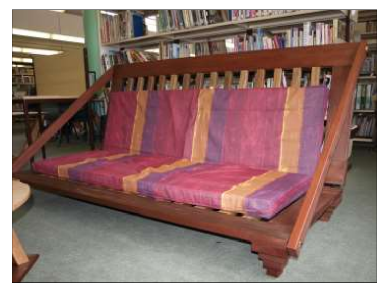
Futon/Day Bed - Daniel Field