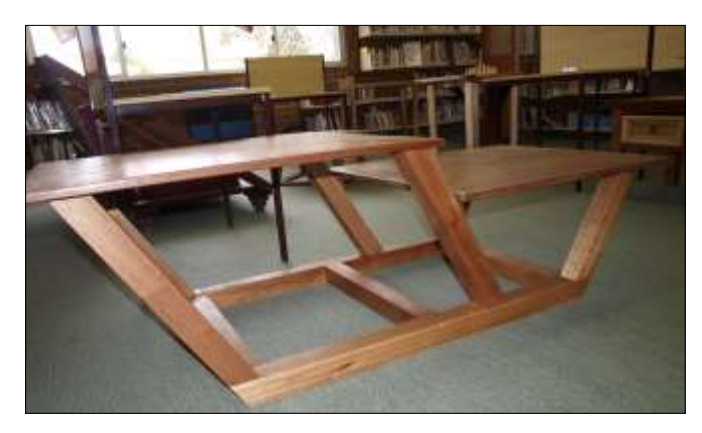
Coffee Table - Lachlan Williams