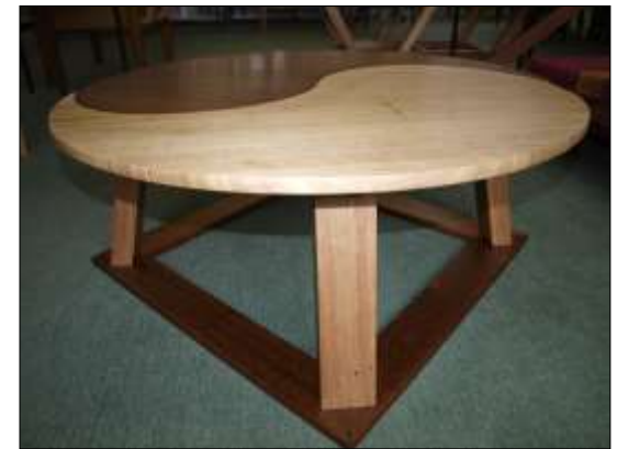
Coffee Table - Lachlan Williams