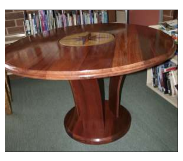
Dining Table - Jacob Clarke