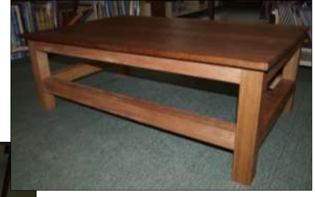
Coffee Table - Julius Bowley