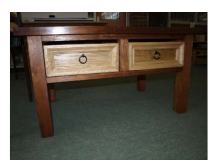
Coffee Table with drawers - Matthew Peacock