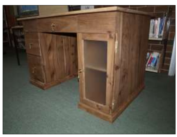
Desk - Sally Attreed