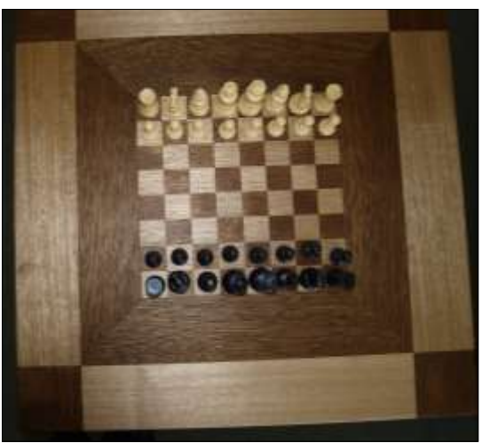
Chess Table - Zac Bosevski