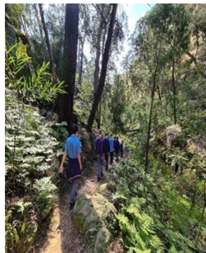
Belmore Class Lake Alexandra