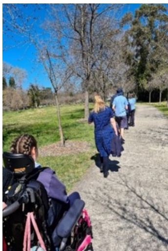
Cherry Tree Walk