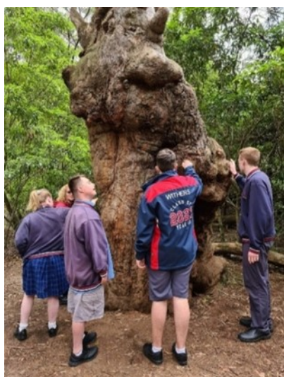
Morton Class Old Man Tree