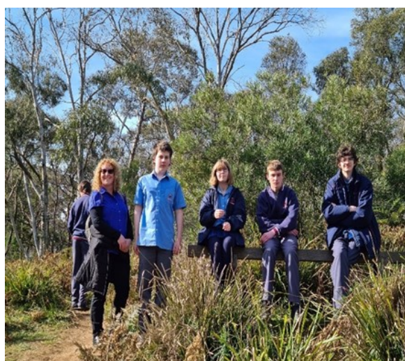
Gibraltar Class Berrima River Walk