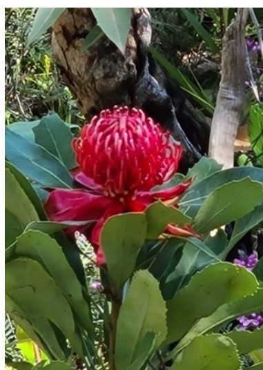
Waratah Carrington Falls