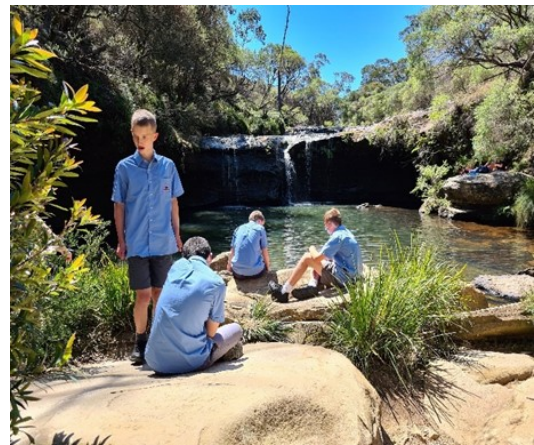
Belmore Class Nellies Glen - Carrington Falls