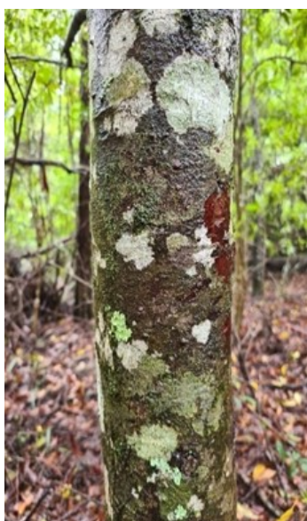
Lichen Covered Trees