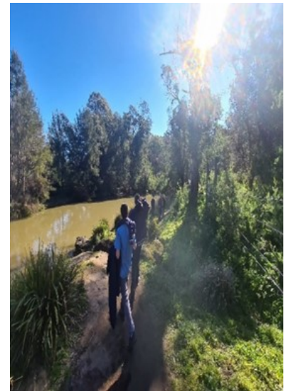
Belmore River Walk