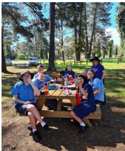
Morton Class Burradoo Park