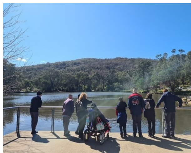
Morton Class Lake Alexander