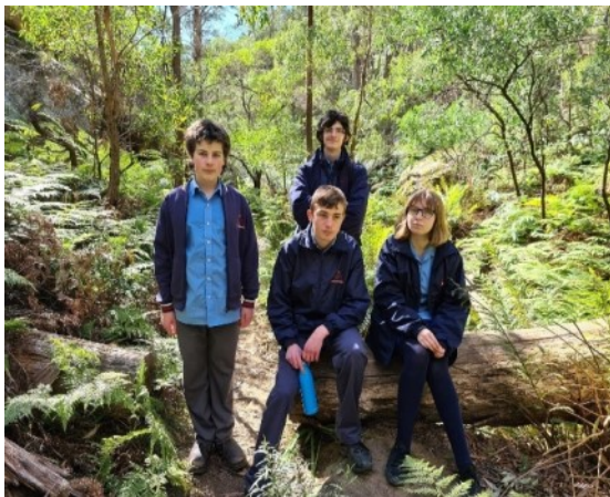
Gibraltar Class Lake Alexandra Bushwalk

We feel extremely privileged to live in such a beautiful and safe part of the world and be able to take our students out into such gorgeous pristine environments, that they may not have seen before, during such a strange and unsettling time. Here is a sample of the many beautiful places we have explored during Term 2, 3 and 4.