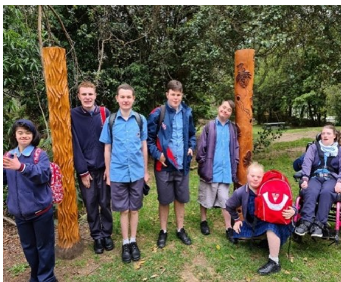
Morton Class Fitzroy Falls Picnic