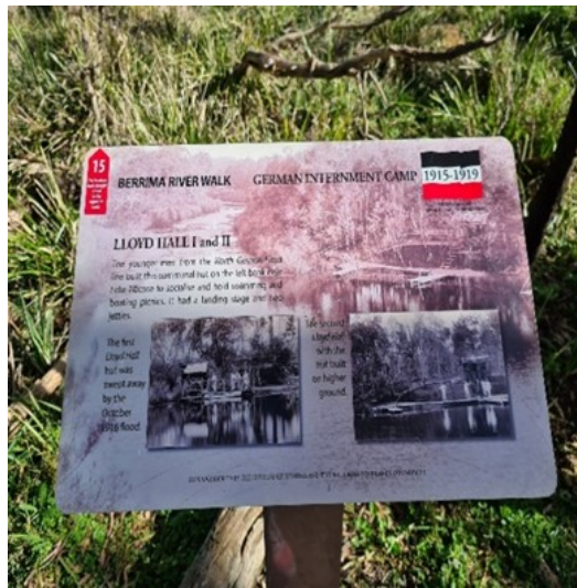
Berrima River Walk